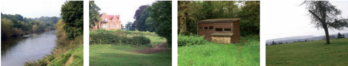
Above: Drovers Pond. Left (from left to right): View of the River Wye; Warham House; A bird hide; the view at Haybluff.