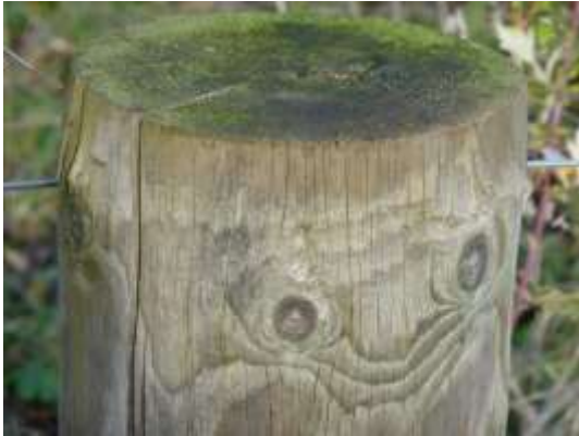
Breinton is a friendly place to live! (N Geeson)

Improved bus services and cycle routes were the predominant suggestion amongst younger people to increase the local transport options.