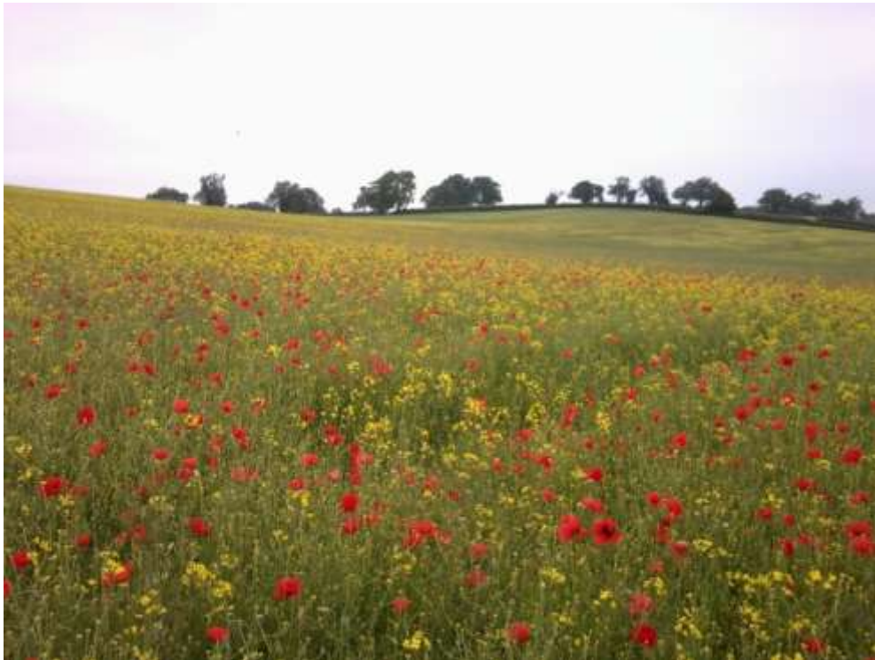
Oilseed rape and poppies near Breinton Manor Farm, June 2013

The CLP will also be used as a basis for developing local land use planning policies in collaboration with Herefordshire Council and other interested parties. Clearly the Parish Council has to work within the overall planning policies of Herefordshire Council. However, every opportunity will be taken to influence these. These opportunities include using the 2014 CLP to develop a Neighbourhood Plan. Despite the recession there is so much change being proposed for Hereford and its immediate hinterland that it is really important that local people have the opportunity to say how they would like their community to develop. If a Neighbourhood Plan is developed and successfully completes the statutory process (including an examination in public and a local referendum) it will have legal status as planning policy.