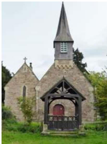
St. Michael's Church, Breinton