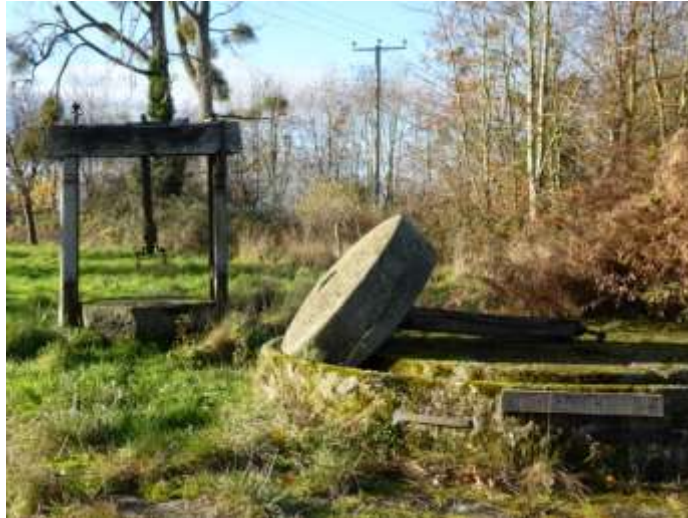
Breinton's cider heritage (N Geeson)

There was very strong, virtually universal, support for continuing to use the land for agricultural purposes, while a majority were opposed to commercial or light industrial uses especially distribution / warehousing though less so for small offices. There was more support than opposition for tourism uses, while housing and second homes were, on balance, not considered appropriate use of the land.