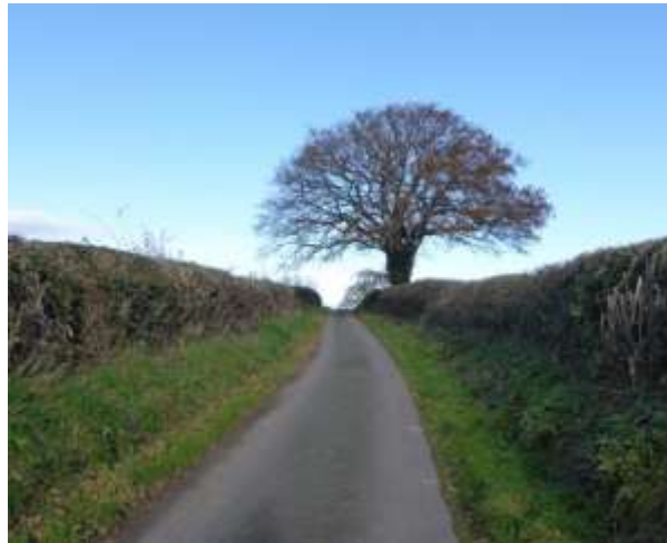
Magpie Lane in Breinton, also known as Gypsy Lane

Of the adult questionnaires completed, 47% were by men and 53% by women, they were divided approximately equally between those who lived in the Kings Acre Road area and those elsewhere in the parish, and 60% were from residents who had lived in Breinton for over 10 years.