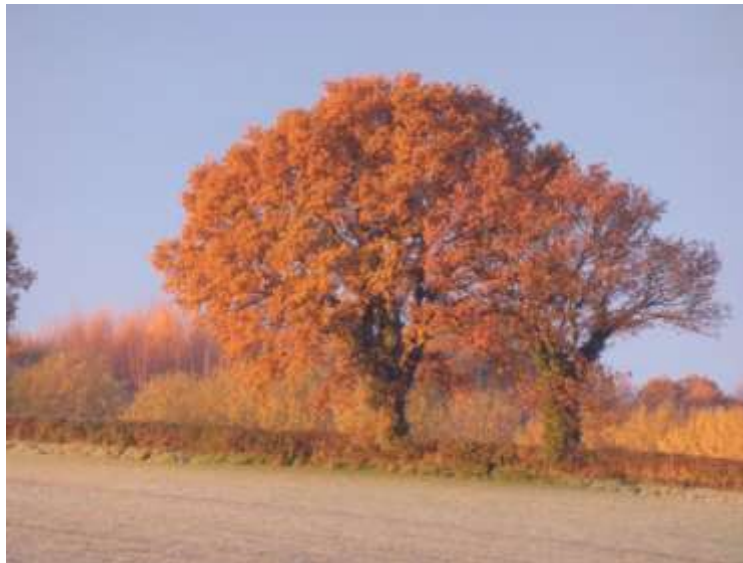
View towards Drovers Wood, planted by the Woodland Trust in 2000 to mark the Millennium

Musical concerts, exercise classes and car boot sales were amongst the most popular additional activities that people would use if provided at the Church or Village Hall, each selected by around a third of respondents.