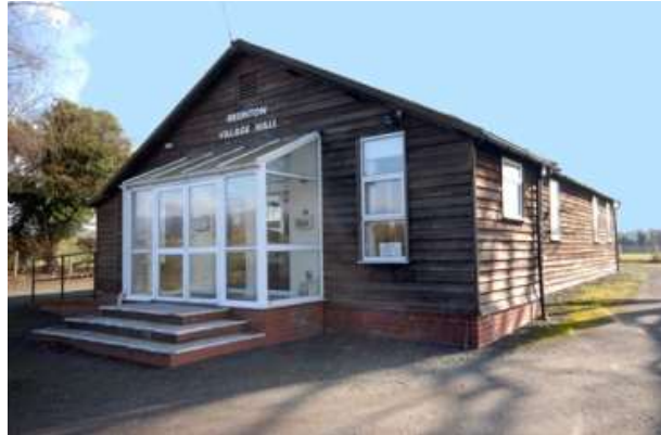
- especially at Breinton Village Hall!