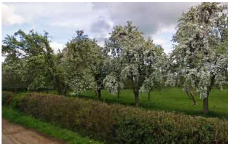
Breinton has many orchards, old and new