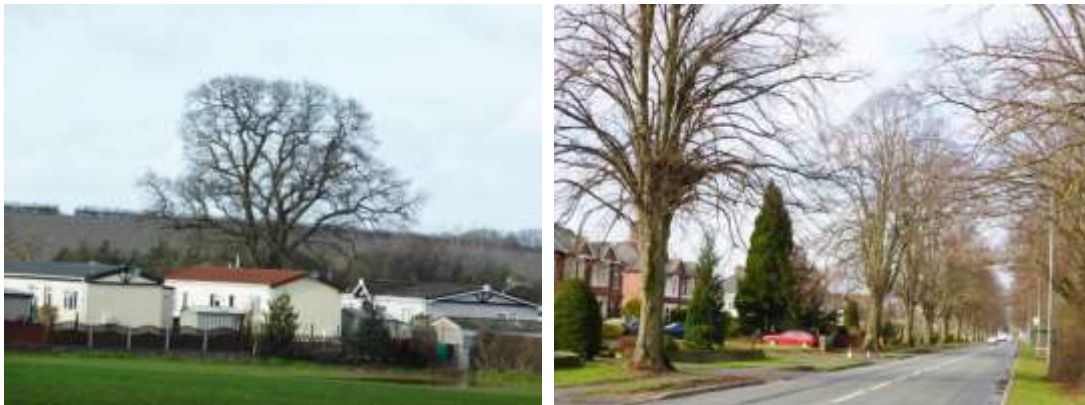
Breinton is rural but borders the city (N Geeson)